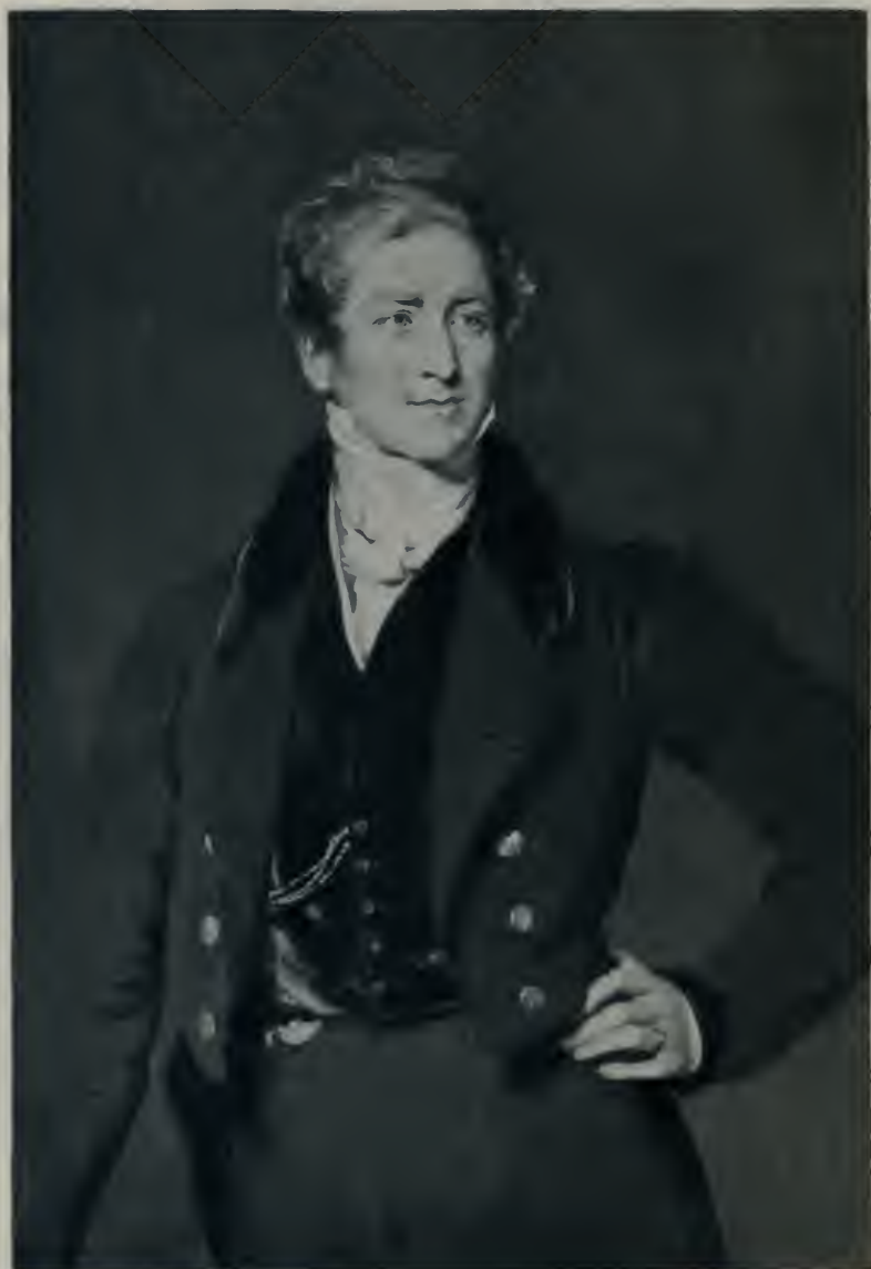
Sir Thomas Lawrence, P.R.A. percut.